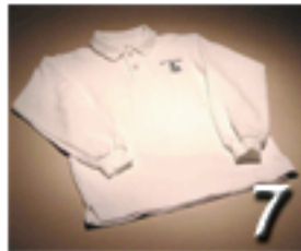
L.S./S.S. Polo Shirts