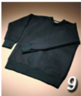
Crew Neck Sweatshirt